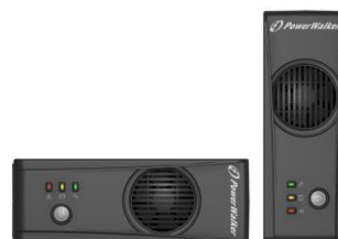
2-in1 Rack/Tower design