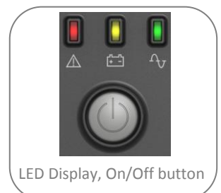
LED Display, On/Off button